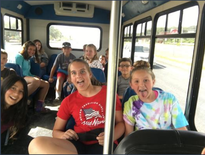
These pictures are from the Middle School Mission Trip - City Life Camp